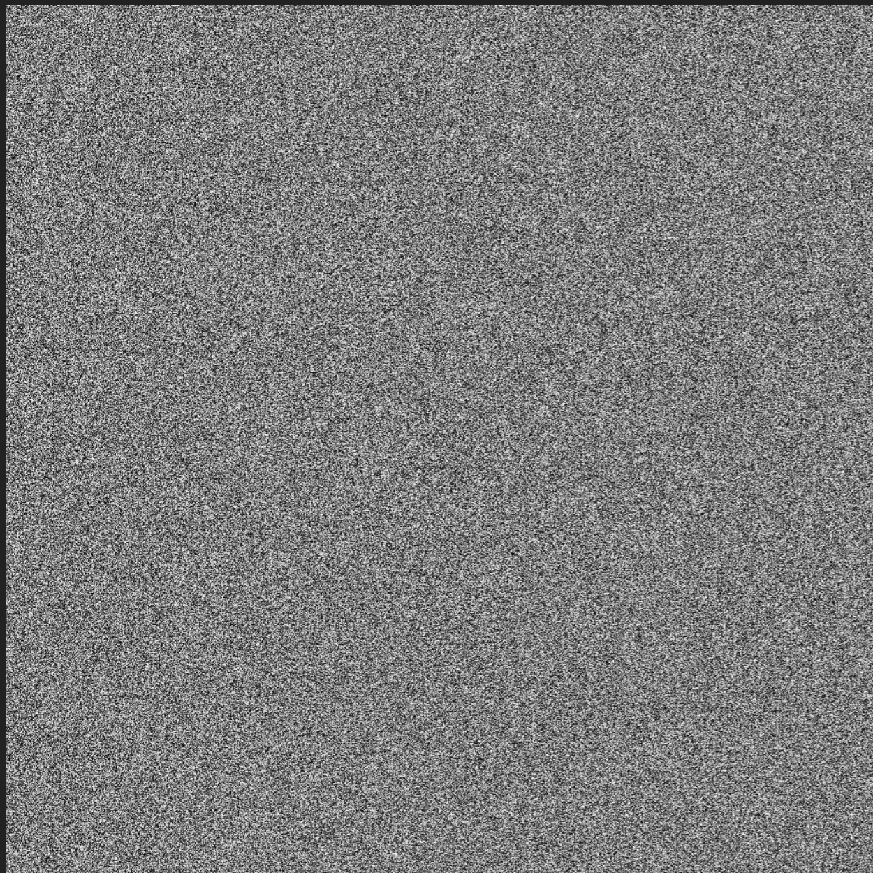
noise using the rand() function

and some sin() waves using x and y as input